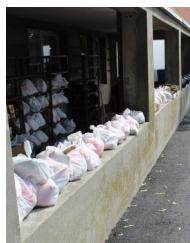
Bagged & Ready for Guests